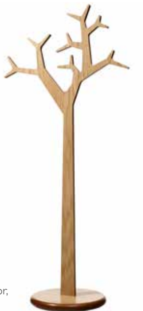
TREE. It's not difficult to figure out what inspired this iconic coat hanger. Magical and sublime. Wall mounted or free standing on floor, two different sizes and a range of colours.