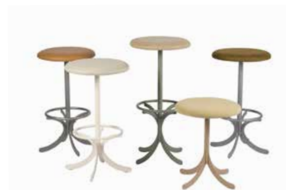
ATLAS. Stool with seat in solid oak or ash, and steel base. Robust construction enabling use both indoors and out. The seat can also be upholstered in fabric or leather. Available in three different heights.