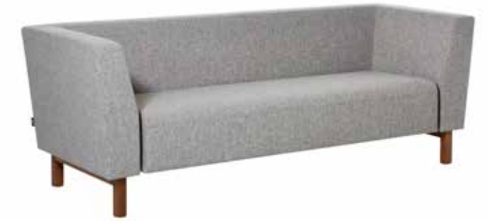
GAP LOUNGE. A little softer than Gap Café, with a lower sitting height. The gap between the seat and backrest creates a spacious feel and makes it easy to keep clean. Connectible modules enable a range of combinations, customized measurements can be offered upon request.