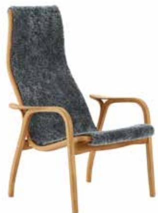
LAMINO. Swedese's crown jewel, conceived by Yngve Ekström. Timeless, elegant and as stylish as it was 50 years ago. Laminated beech, oak, ash or walnut veneer. Upholstered in sheepskin, fabric or leather.