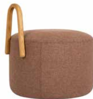
AMSTELLE. Pouffe which forms part of an extensive family of functional, modern furniture, including chairs, armchairs, pouffes and stools. Handle in oak or ash. Upholstery in fabric or leather. Wheels available on medium and large pouffe.