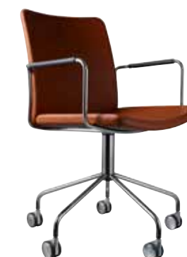
STELLA. A perfect fit at your desk, in the waiting room, lunchroom or auditorium, for the receptionist or the CEO. The armrests can be upholstered in leather; the chair is available with adjustable height and the base comes in chrome, white or black lacquer. Other colours upon request.