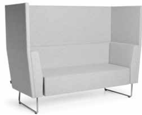
GAP MEETING. Easy-to-maintain sofa with a slightly higher backrest in order to provide privacy and calm in modern workplaces. Seat with a gap between the seat cushion and backrest. Easy to combine with other linking units. Legs in oak or ash, or sled base in metal. Measurements can be customized upon request.