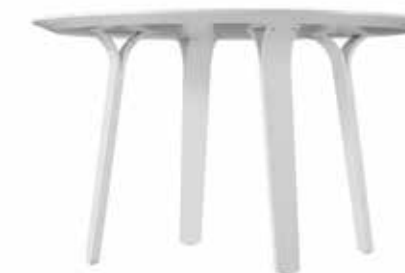
DIVIDO. Simultaneously modern and classic table in three different sizes. Tabletop in natural ash, black stained ash or white laminate.