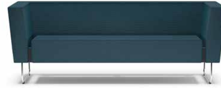
GAP CAFÉ. A sofa system with gap between back and seat as well as armrests and seat creates a spacious feeling and is easy to clean. Straight or curved sections can be combined, measurements can be customized upon request. Legs in oak or ash, or sled base in metal.