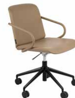
AMSTELLE. Armchair with steel base which forms part of an extensive family of functional, modern furniture, base and castors, armchairs, pouffes and stools. Steel base in chrome, white or black. Other colours upon request.