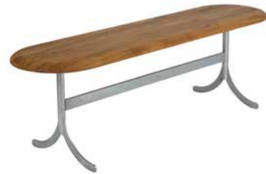
ATLAS. Bench with seat in solid oak or ash, and steel base. Robust construction enabling use both indoors and out. The seat can also be upholstered in fabric or leather.