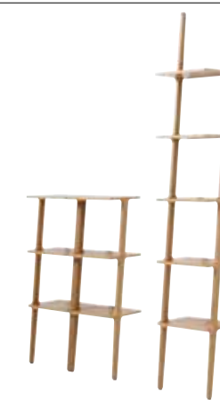
LIBRI. Practical, buildable bookshelf, combining function with artistic flair. Combine multiple shelves to create a complete storage wall or room divider. Four different heights, all with the same strong design.