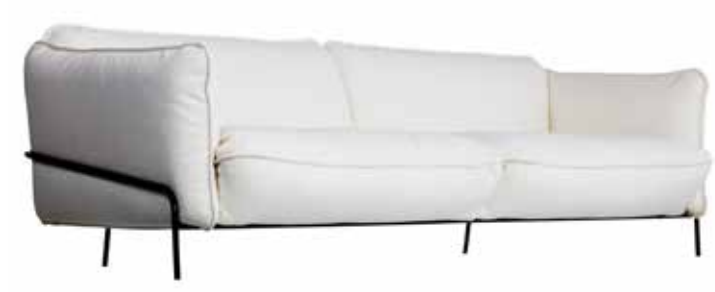
CONTINENTAL. Spacious, modern and comfortable with a continental attitude. Imaginative filling adds to the overall impression. Upholstery in fabric or leather, base in chrome, black or white lacquer.

TO VIEW THE AT WORK COLLECTION RANGE, VISIT swedese.se