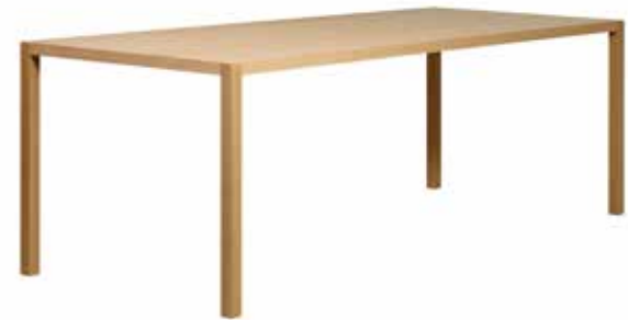
BESPOKE. Fully customized and produced in requested dimensions. Extremely solid table with elegant features. Tabletop in oak, ash or laminate. Steel legs encased in wooden socket in oak or ash.