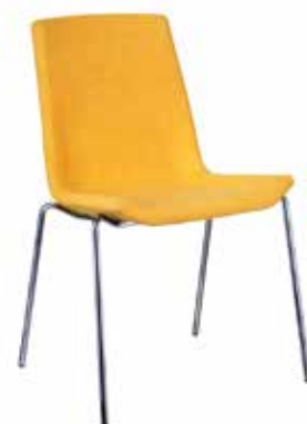
HAPPY. Stackable, comfortable chair and an unmistakable member of the Happy family. Moulded seat providing excellent comfort, chrome legs in black or white lacquer. Available with armrests.