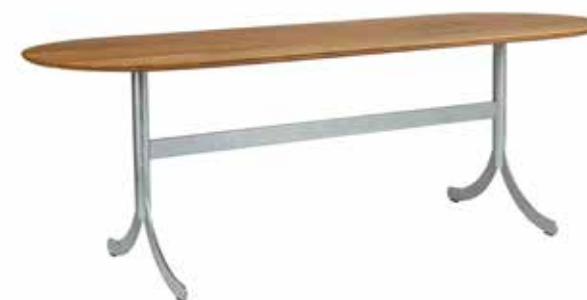
ATLAS. Table in solid oak or ash, with steel base. Robust construction enabling use both indoors and out. Top also available in oak or ash veneer, or compact laminate.