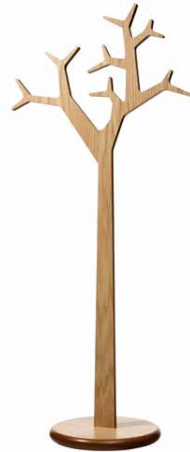
TREE. It's not difficult to figure out what inspired this iconic coat hanger. Magical and sublime. Wall mounted or free standing on floor, two different sizes and a range of colours.