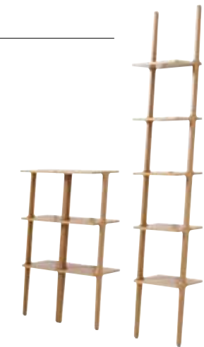
LIBRI. Practical, buildable bookshelf, combining function with artistic flair. Combine multiple shelves to create a complete storage wall or room divider. Four different heights, all with the same strong design.

TO VIEW THE HOSPITALITY COLLECTION RANGE, VISIT swedese.se