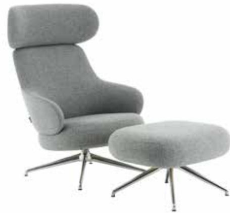
PILLO. Versatile, comfortable easy chair with generous proportions and a timeless feel. Available with or without adjustable neck support. Return mechanism and lock function when chair is in lowered position. Optional foot stool.