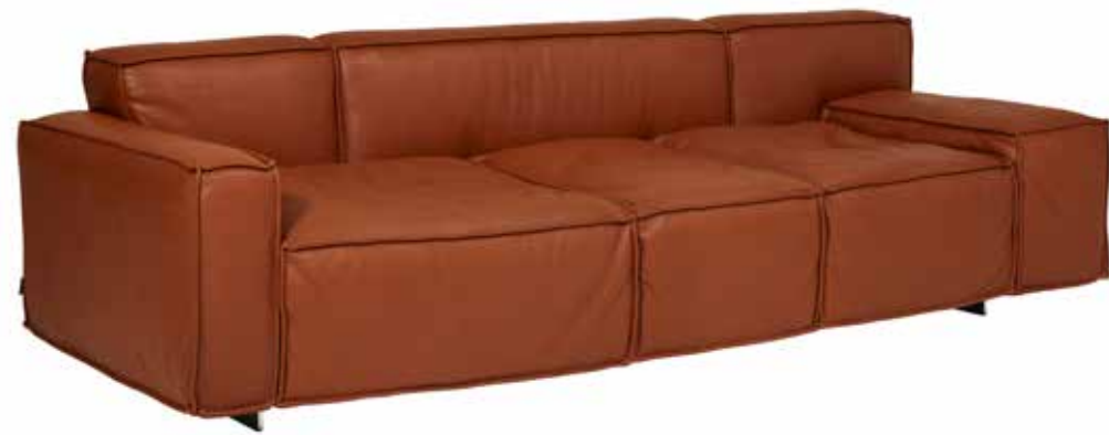
BOXPLAY. The natural centre of attention in the room. At once robust and elegant, with an asymmetrical shape that creates a playful impression. Features a solid wooden frame and upholstery in fabric or leather.