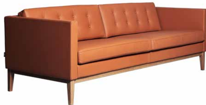
MADISON. The best of Scandinavian aesthetics, featuring craftsmanship, functionality and low-key design. Add your own personal stamp by playing with different sizes and adding/removing the buttons on the back cushions. Legs in oak or sled base in chrome, black or white lacquer.

TO VIEW THE HOSPITALITY COLLECTION RANGE, VISIT swedese.se