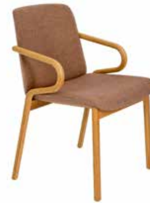
AMSTELLE. Armchair which forms part of an extensive family of functional, modern furniture, including chairs, armchairs, pouffes and stools. Legs in oak or ash.