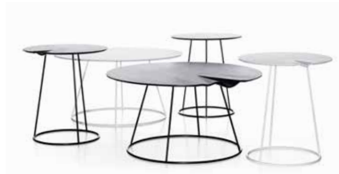
BREEZE. Tabletop featuring poetic design, inspired by the soft summer breeze. Two possible configurations; the smaller and taller and the larger and lower. Top in white or black lacquered ash or with laminated copper plate. Matching base in lacquered steel or copper-plated steel.