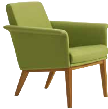
LAZY. Designer Bror Bojje's minimalist, elegant sofa and easy chair are highly durable and robust as well as functional and elegant. Includes springs in seat and option of fully removable upholstery.