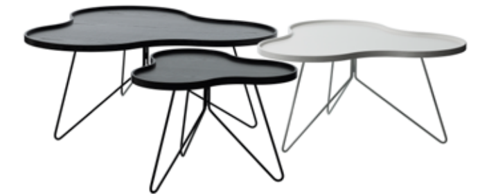
FLOWER. Organically shaped with stalk-like legs and made with the veneer lamination technique, this table has become a symbol of Swedese. A classic piece with a variety of combinations, including oak, ash, walnut or even fully white or black. Three different heights enable a nest of tables to be created.