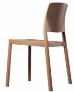
GRACE. A simple, smart and comfortable chair with a clear identity. Accessories include upholstered seat and/or back, acoustic absorption, linking device and trolley. Comes in a range of designs, armchair included.