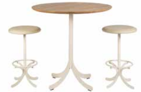
ATLAS. Table in solid oak or ash, with steel base. Robust construction enabling use both indoors and out. Top also available in oak or ash veneer, or compact laminate. Hooks under the tabletop are also available.