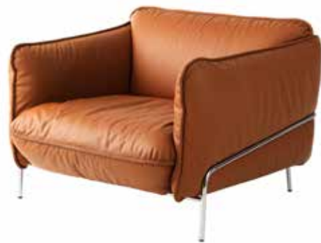
CONTINENTAL. Spacious, modern and comfortable with a continental attitude. Imaginative filling adds to the overall impression. Upholstery in fabric or leather, base in chrome, black or white lacquer.