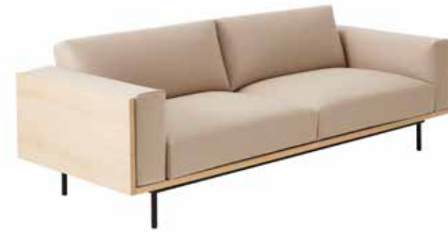
WOOD. Minimalist sofa featuring simple, timeless lines. Features minimalistic shape and authentic natural materials. Upholstery in fabric or leather, with only one visible seam – on the armrest. Legs in wood or black metal.