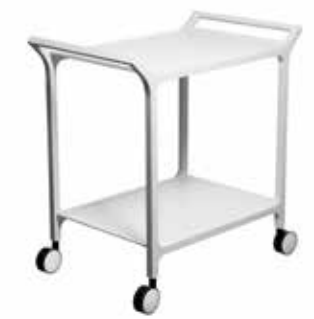
TEATIME. Elegant serving trolley with castors and detachable tray. Create your own unique Teatime by combining different materials for the trolley, tray and shelf; natural ash, white or black lacquer.