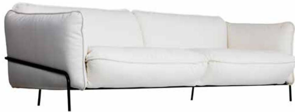
CONTINENTAL. Spacious, modern and comfortable with a continental attitude. Imaginative filling adds to the overall impression. Upholstery in fabric or leather, base in chrome, black or white lacquer.