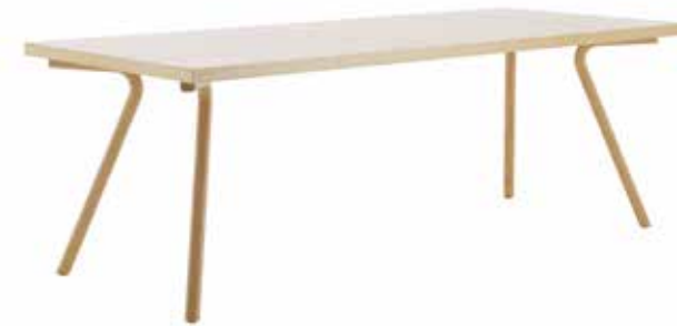
BESPOKE ANGLE. Fully customized and produced in the dimensions requested. Extremely solid table with elegant features. Tabletop in oak, ash or laminate. Steel legs encased in wooden socket in oak or ash.