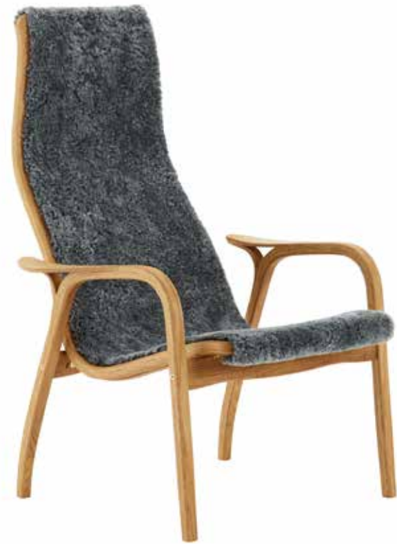
LAMINO. Swedese's crown jewel, conceived by Yngve Ekström. Timeless, elegant and as stylish as it was 50 years ago. Laminated beech, oak, ash or walnut veneer. Upholstered in sheepskin, fabric or leather.