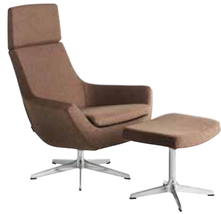
HAPPY. With a welcoming smile, happy blends in with all types of surroundings. With or without neck support. The serie includes easy chair, sofa, barstool and stackable chair.